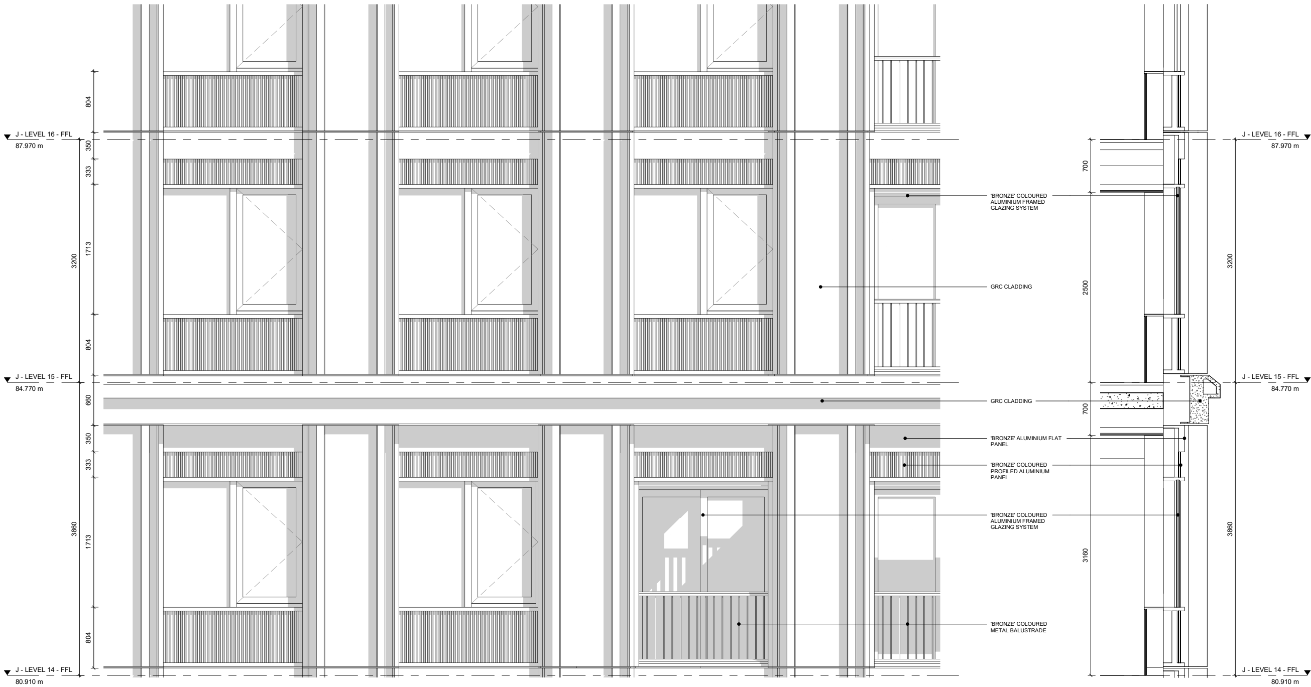
1 Block J - Bay Study 04 - Elevation 1 : 25